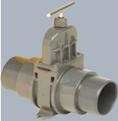
PVC inlet sluice valve DN 100 or DN 150, with pipe sockets bonded in, for the time-saving and space-saving direct connection to the inlet clamping flange.

C ETab r ta 0 00the s Tf0.025 Tw 0mping f in.0226