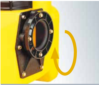
Height adjustable clamping flange compli 400